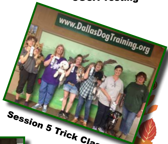
Session 5 Trick Class