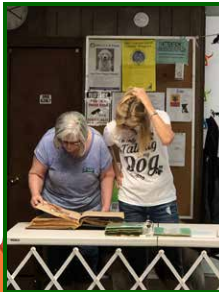
Viewing the DTDCDC Scrapbook