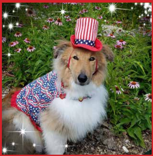
You know who! This is how she dressed to go to the VA for Veterans Day.