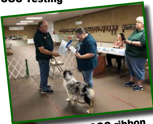
Receiving CGC ribbon