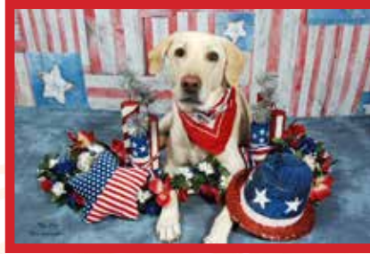
Happy 4th of July from the Hitchborn clan! They are ready to celebrate!