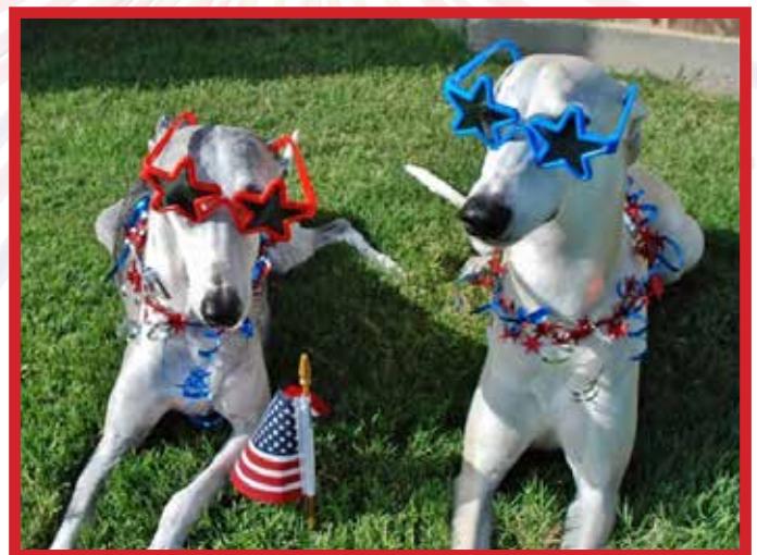
Krystal Hatcher's gorgeous whippets are stylin' their fabulous patriotic shades and duds!