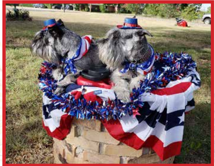
BeBe and Fiona Shuman in their patriotic finery are ready to celebrate!