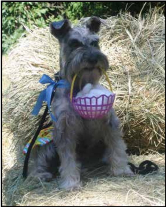
Chloe as the cotton pickin' dog