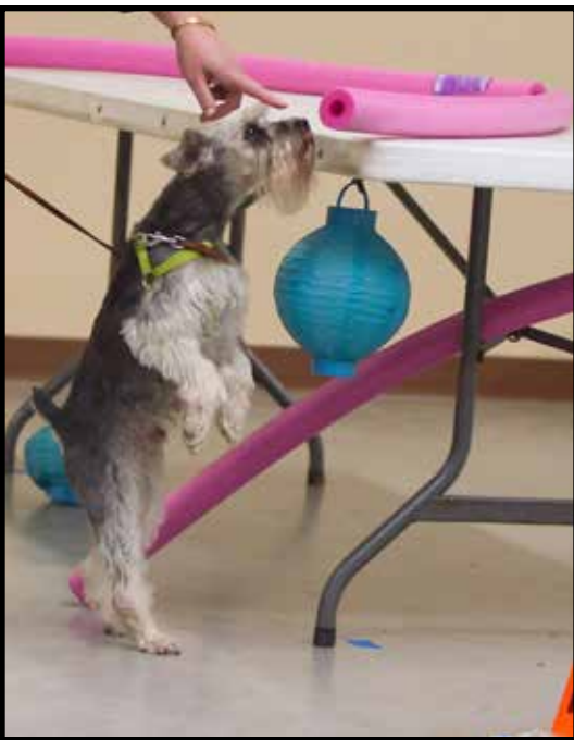
Kelly working on his Elite Nosework title.

Although the AKC and UKC in the U.S. assign the Miniature Schnauzer to the Terrier group, they actually have no terrier blood in them.