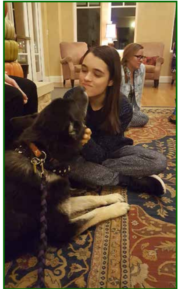
Sheba enjoys visiting with a young girl during a therapy visit to Ronald McDonald House.

Being a member of the DTCDC made all of the above possible and I look forward to the future.