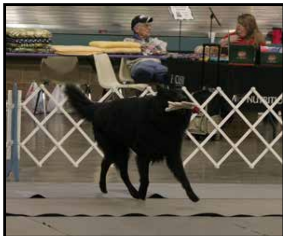
EZ with gloves.