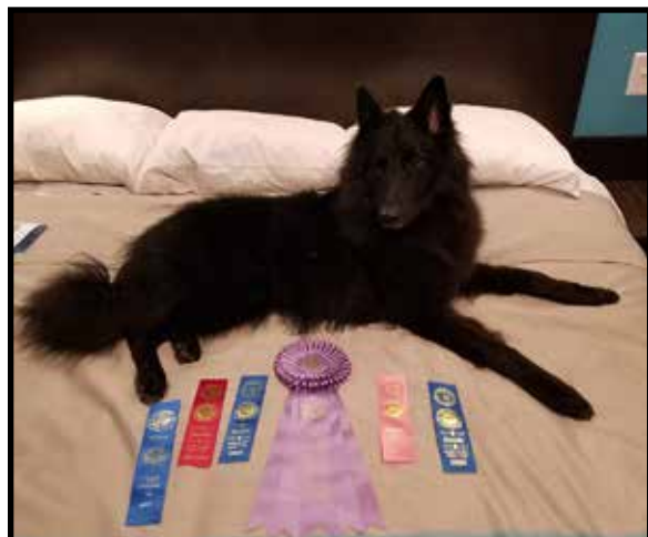
This Teddy he is just getting started. He has a couple obedience titles and one major in confirmation.