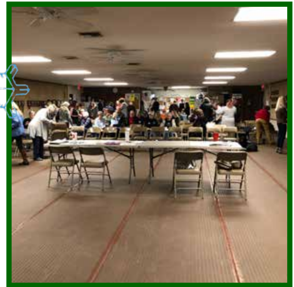
Club members set up chairs and tables for the January meeting. The attendance roster count was 59 in attendance.