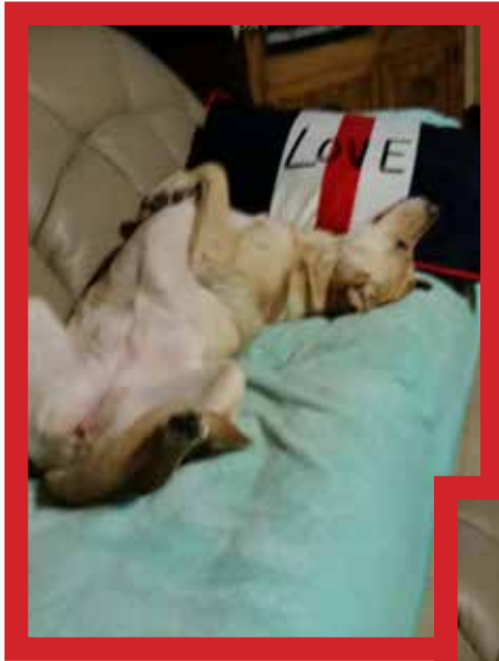
Benita Zapata shared Raiden napping with a "Love" pillow!